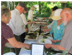
Feasting with Friends