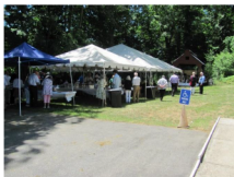
The celebration tents at FAHS

One Fine Day, specifically Sunday, June 5th, beginning at noon, the Finnish American Heritage Society held a Commemoration; a Celebration of 35 years of lively and meaningful existence. The prayers by the Planning Committee to the Finnish Weather Gods could not have been better answered; sunny, temperatures in the 70sF and low humidity. Even the cottonwood trees surrounding the Finnish Hall seemed to be celebrating with their annual several-day snowfall of cotton fluffs wafting through the air and vaguely whitening the ground. A large collection of guests from near and far gathered under two large tents set up to one side of the Hall to feast, listen to good music, meet and greet, and bring glad tidings and fond memories and cheers in numerous speeches.